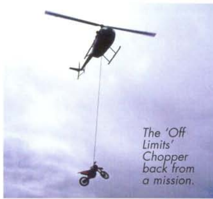
The 'Off Limits' Chopper back from a mission.